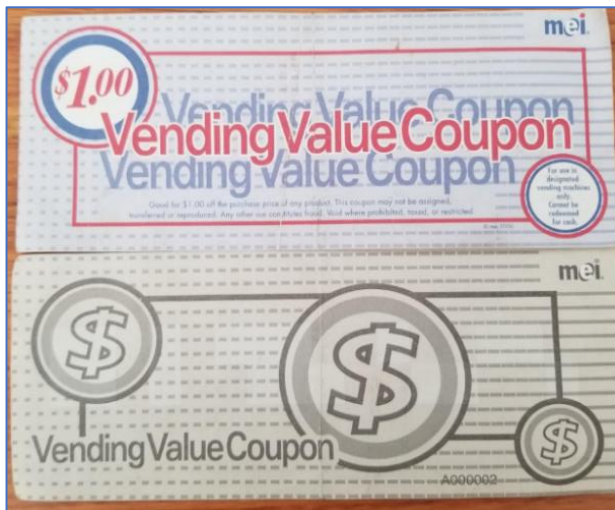
Figure 1 – “Safety Bucks”

I created a policy to explain the safety practices and incentives to create transparency to ensure legitimacy. Programs as such, when implemented with transparent parameters requiring the safety practices needed for a valid and reliable safety culture, encourage worker safety and leadership. One employee was/is a ‘take-charge’ employee who always maintained a safe and clean working environment. If she were caught up on her production, she would often be seen a couple machines away helping others clean up their areas. She identified many hazards through near-miss reports. She was not certified in first aid, but if an injury, she was a runner who located the nearest first responder and brought them to the scene. For motivated