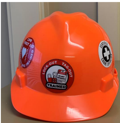
Figure 2 – Helmet certification labels

By sight alone, we can tell who is certified to operate a forklift, perform CPR, operate a crane, or perform other functions immediately and even quicker if the labels are standardized in placement. This idea originated from my love for NCAA sports and the stickers on football players' helmets showing their achievements. With valid and reliable leading indicators (such as training completions, safe observations and inspections, and others), these achievements can also include days without incidents or other lagging indicators if not based on non-reporting or other negative factors.